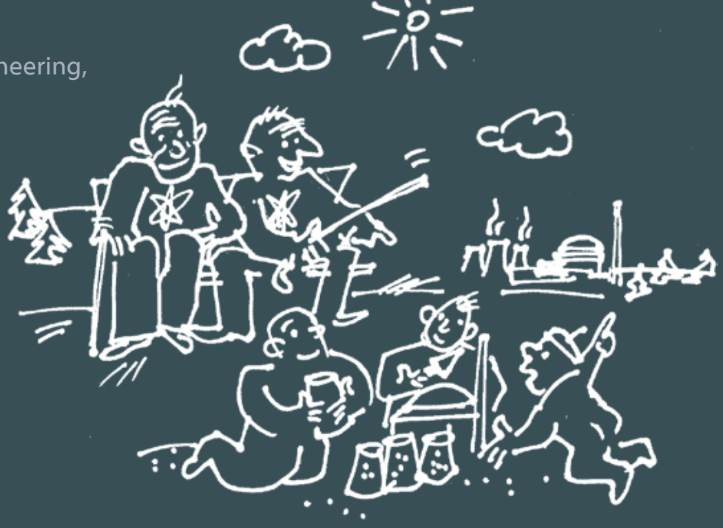
Dont worry daddy, we are building generation IV right away!